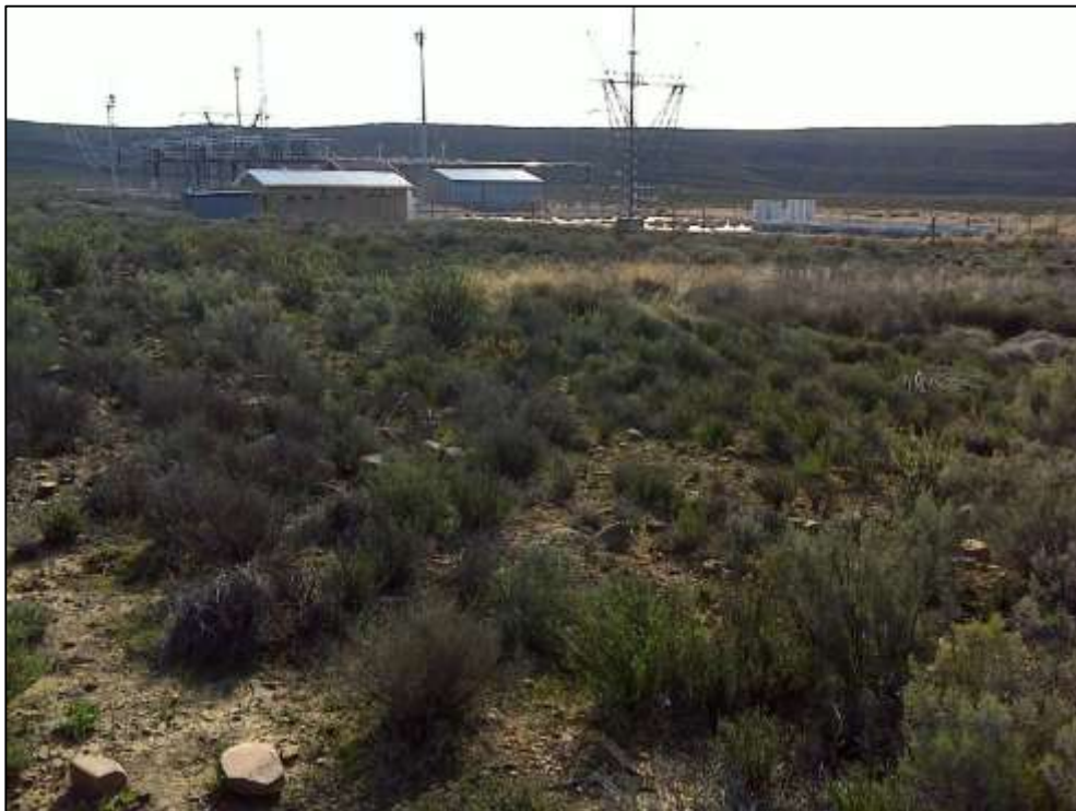
Figure 6. View of the general landscape of the proposed area of the existing Komsberg Substation facing north west with the existing substation and power lines in the background.