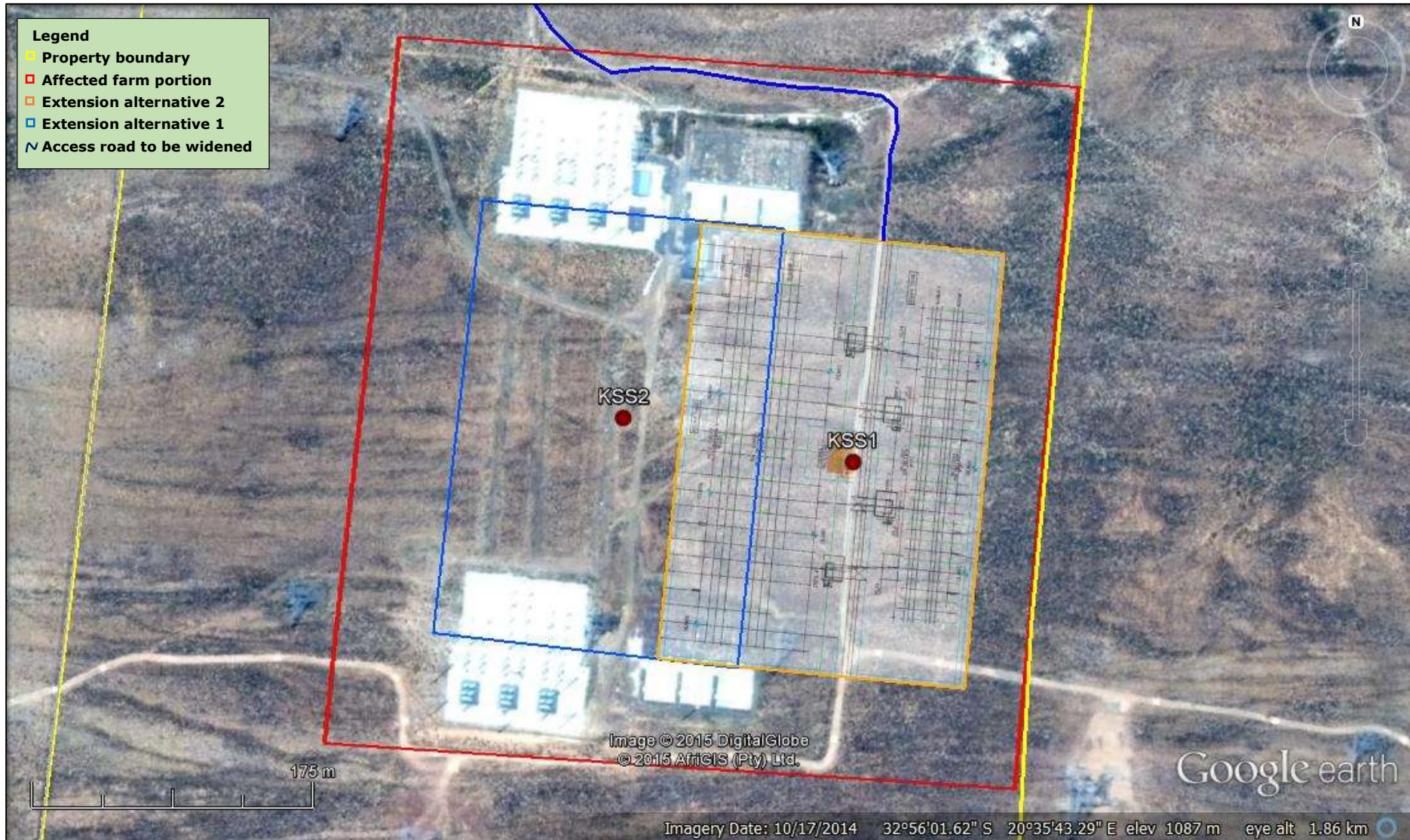
Figure 4. Close-up aerial view showing the location of the proposed extension of the existing Komsberg Substation (Alternative 1 and Alternative 2) and general GPS co-ordinates (KSS1 and KSS2).