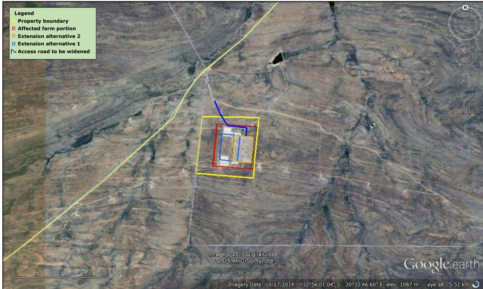
Figure 3. Aerial view showing the location of the proposed extension of the existing Komsberg Substation (two alternative areas) and widening of the access road situated on Eskom owned land on the farm Standvastigheid 210.