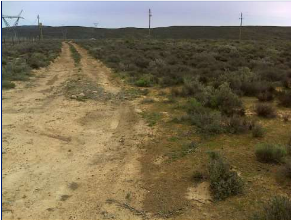
Figure 9. View of the access road to be widened facing west.