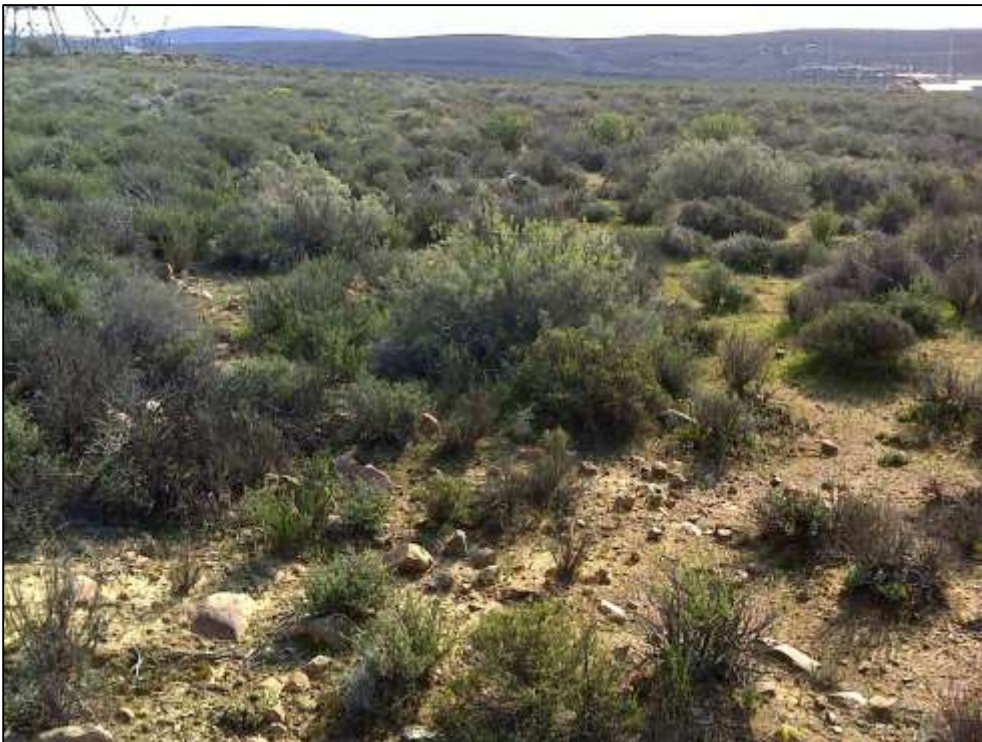
Figure 8. View of the general landscape of the proposed area within the boundaries of the existing Komsberg Substation facing west.