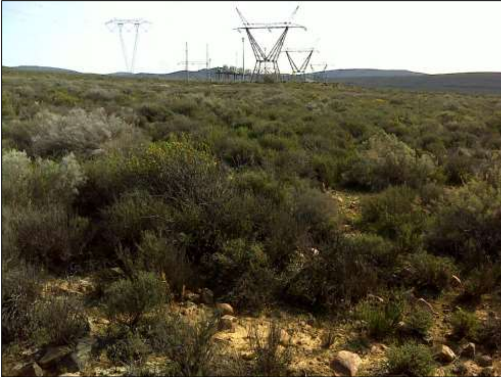
Figure 7. View of the general landscape of the proposed area within the boundaries of the existing Komsberg Substation facing south west.