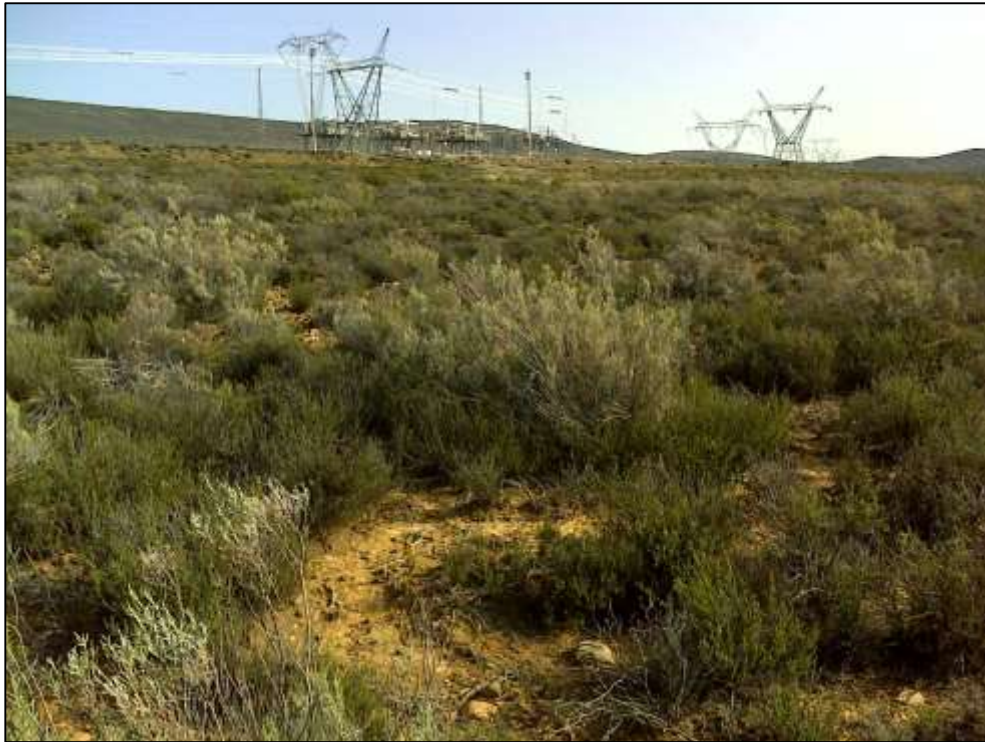
Figure 5. View of the general landscape of the proposed area of the existing Komsberg Substation facing south west with the existing substation and power lines in the background.