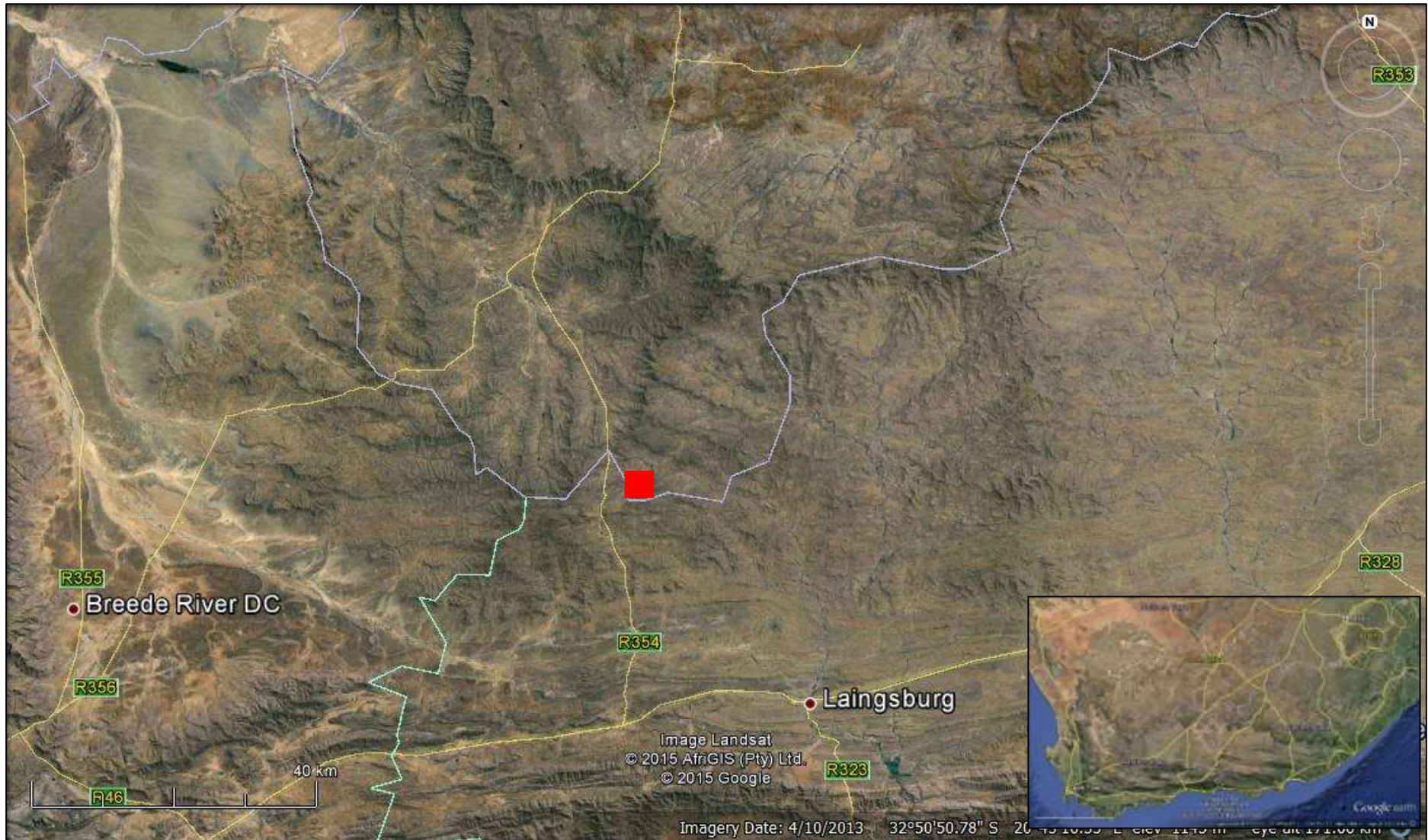
Figure 2. Aerial view showing the location of the proposed extension of the existing Komsberg Substation and widening of the access road.