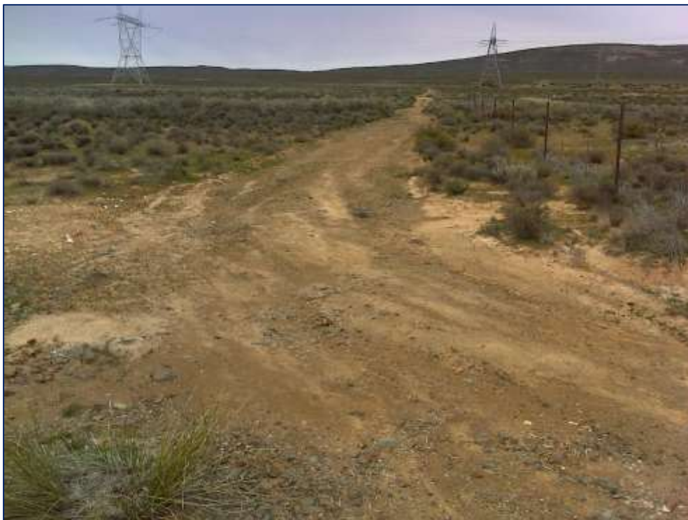
Figure 10. View of the access road to be widened facing east.